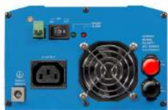
Phoenix Inverter 12/800 with IEC-320 socket