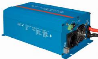
Phoenix Inverter 12/800 with Schuko socket

For our lower power models we recommend the use of our Filax Automatic Transfer Switch. The Filax features a very short switchover time (less than 20 milliseconds) so that computers and other electronic equipment will continue to operate without disruption.