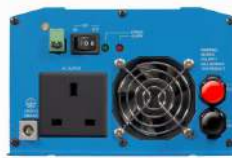
Phoenix Inverter 12/800 with BS 1363 socket