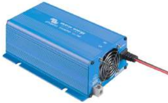
Phoenix Inverter 12/180