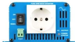
Phoenix Inverter 12/180 with Schuko socket