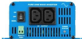
Phoenix Inverter 12/350 with IEC-320 sockets