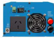
Phoenix Inverter 12/800 with AN/NZS 3112 socket