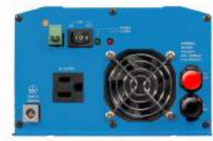
Phoenix Inverter 12/800 with Nema 5-15R socket