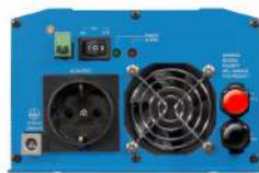
Phoenix Inverter 12/800 with Schuko socket